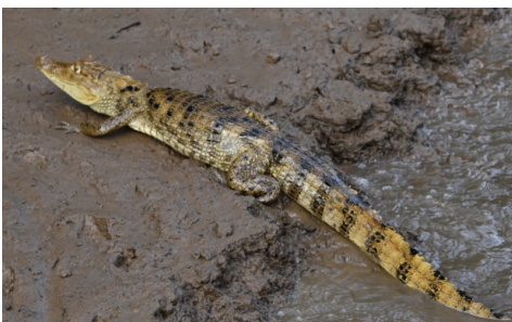
Crocodile, what do you feed your babies?